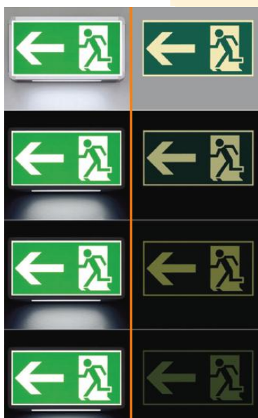
Below: Comparison between internally illuminated exit signs and PL exit signs shown before Power failure and then at 10minutes, 30 minutes and 60 minutes after power failure

Emergency and exit lighting is an essential life safety device and the non-compliance with regulations regarding its correct installation and maintenance jeopardises the safety of building occupants. There is therefore a legal requirement to comply with the NCC and AS/NZS 2293.1 and the WH&S legislation. A serious breach can result in an indictable offence, and carries significant financial penalties and terms of imprisonment for individuals.